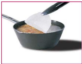
Place a Grease Blotter on top of the hot soup.

Never again use paper towels or inefficient utensils to remove grease and fat by-products off your favorite meals. Grease Blotter by MysticMaid solves one of the messiest problems in the kitchen. It quickly and easily absorbs the surface grease, fats and oils as food cooks while leaving the rest of the liquids. No more paper towels or sloppy straining. Grease Blotter is so versatile that it works on soups, stews and broths of all kinds. It also works equally well on solid foods like bacon, chicken, sausage, pizza and so much more. ■