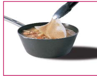
Using a utensil, remove the saturated sheet.