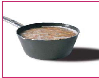
The sheet will absorb grease, fats and oils.